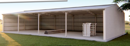
All Alu Zinc Sheetting