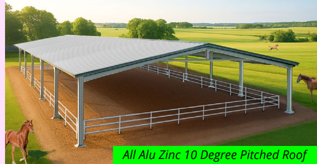
All Alu Zinc 10 Degree Pitched Roof