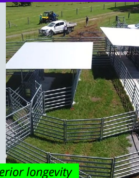
All Zinalume materials for superior longevity