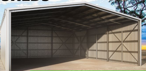
All Alu Zinc 10 Degree Pitched Roof

The fully open end is ideal for farmers wanting to store extra large machinery without the complication of shed columns.