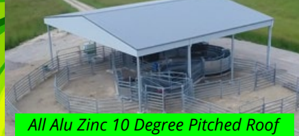
All Alu Zinc 10 Degree Pitched Roof

AVAILABLE WITH GABLE INFILL ENDS Ask about your Big DEAL!